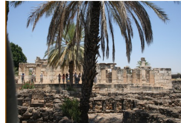
The Capernaum synagogue, as it now stands, was built in the second century AD on the foundations of the original structure which the Romans destroyed.