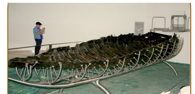
The remains of a first century fishing boat found buried and partly preserved in the silt of the lake in 1986

Use the following words: fishing, synagogue, Simon Peter, north western, farming, 1500, occupied.